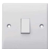
Single Gang Switch