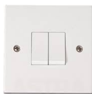
Double Gang Switch